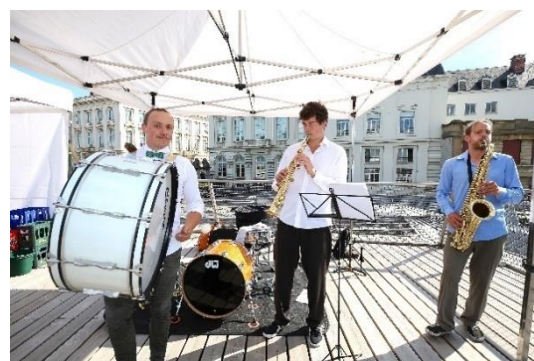
SBS annual conference “Standards: A gateway for SMEs to the European Single Market and beyond?” in the Museum of Fine Arts