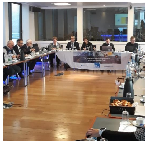
The SBS experts' meetings were held in Brussels on 13-14 February and 8 November