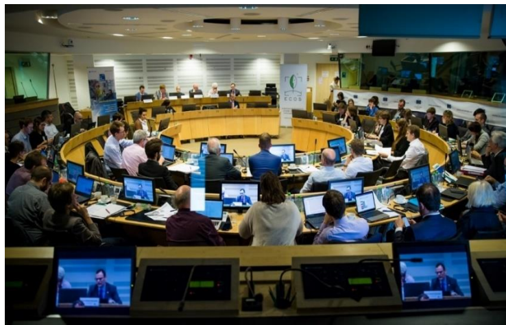
SBS/ECOS workshop on 12 June in Brussels