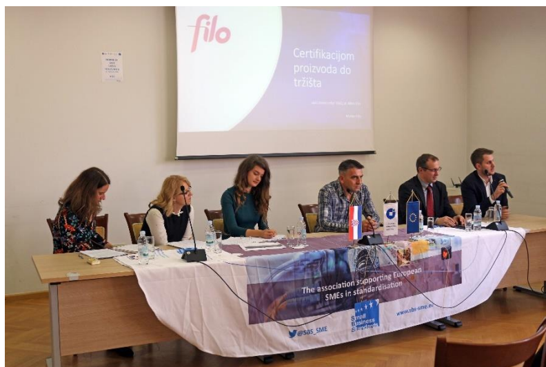
Opening session at the Croatian seminar on 11 October

The second seminar, organised with the support of HOK (the Chamber of Trades and Crafts), was held on 11 October in Zagreb (Croatia). Finally, SBS organised a seminar in Lisbon (Portugal) on 17 December with the Portuguese Industrial Association (AIP).