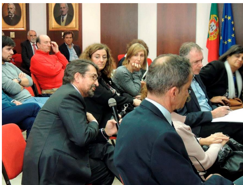
Debates among the participants at the seminar held on 17 December in Lisbon