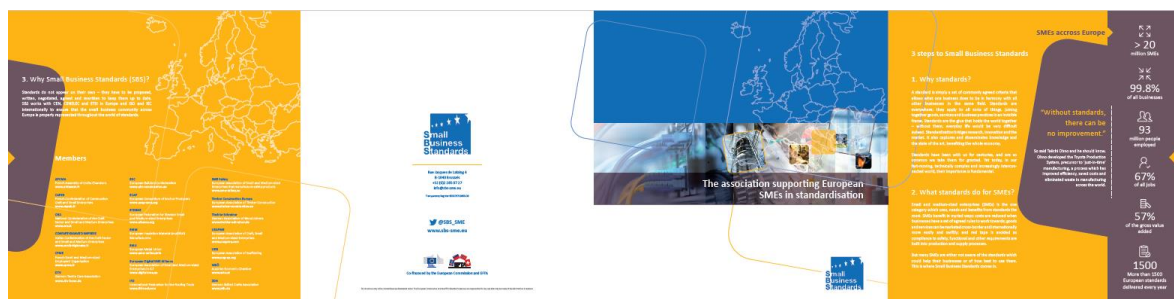
SBS corporate brochure

Moreover, the time seemed right to develop a strong identity for the association, in order to improve its recognition among the European institutions and in the Member States. To this end, the SBS corporate brochure was developed, with its own distinctive look and feel. This tool is designed to help representatives familiarise external audiences with the association.